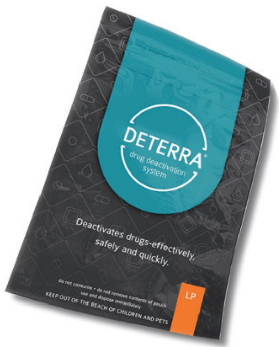
A Deterra drug deactivation pouch.

As soon as you no longer need medication, dispose of it right away. Do not keep opioids "just in case." The best place for unused medications is in a prescription drug drop-box . To find a nearby drop-box in Montana, visit https://dphhs.mt.gov/amdd/substanceabuse/dropboxlocations .